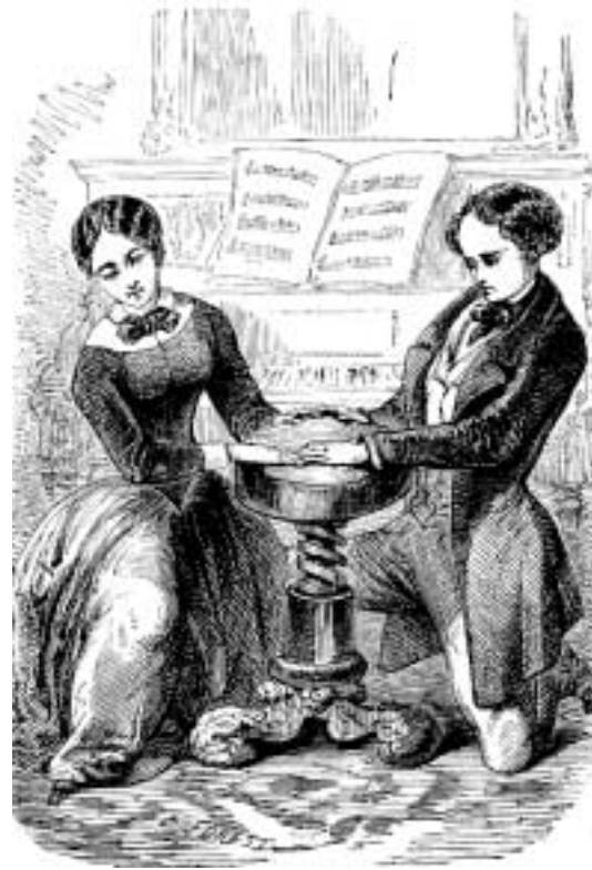
Fig. 2. Parisians in 1853 test the automatic turning of a piano stool [28].

In commonplace actions, we often have thoughts of action that are consistent, prior, and exclusive. We think of turning on a light before doing so, for example, and nothing else seems to be causing the light to go on, so when it happens we conclude that we did it. If we were not thinking of turning on the light and found ourselves flipping the switch, the lack of consistency