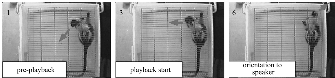
Figure 1. Tamarin response to playback. Prior to playback, all subjects were stationary, looking down and away from the speaker located out of view, up, back and to the subject's left. A response was scored if the subject turned and looked back in the direction of the speaker. The numbers in the upper left-hand corner of each image correspond to frames in the sequence, with a frame rate of 30 frames sec -1 .

turned back and oriented toward the hidden speaker (figure 1). In less than 5% of all trials, the experimenter scored the trial as 'bad'. Such trials included cases where a subject was oriented toward the speaker at the time of playback or was jumping around when the playback was initiated. In an additional 5% of trials, the experimenter scored the response as 'ambiguous', meaning that it was not possible to provide an unambiguous 'yes' or 'no' response score; this typically occurred when a subject's face was occluded by part of the test apparatus or its orientation to the speaker was unclear.